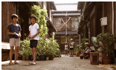
past in the future (Fukuoka Pref.)