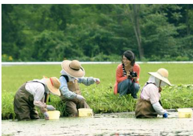
Time of the Northern Akita (Akita Pref.)

Seventy-one films in total were submitted with locations ranging from Hokkaido to the north and Okinawa to the south, and nine short films were selected. (Here is a partial list of the selected films.)