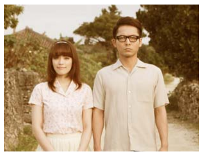
A special presentation of "Heaven's Island" starring Shuji Kashiwabara and Rina Chinen.