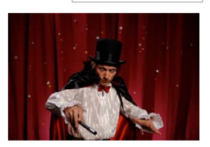
"Instead of Abracadabra"