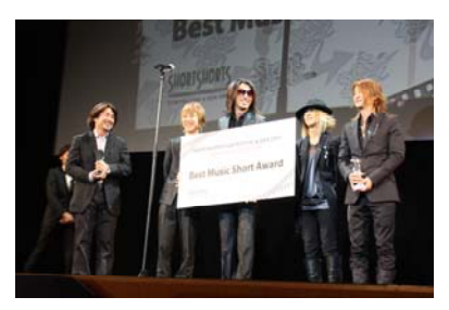
Last year's winner of Music Short PV Competition Best Short Award: GLAY

*Acclaimed VFX studio based in New Zealand