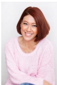
LiLiCo Festival Ambassador