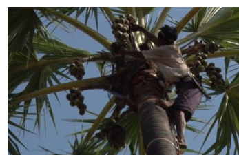
SSFF & ASIA 2017 Grand Prix "Sugar & Spice"