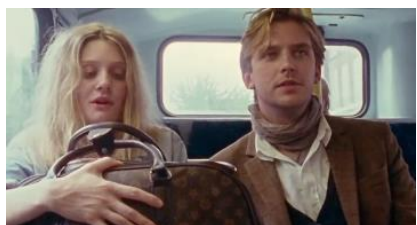
"Babysitting" starring Dan Stevens