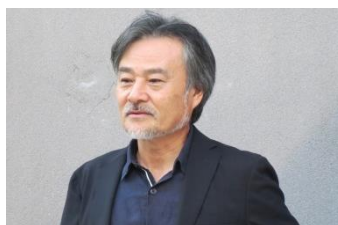
Kiyoshi Kurosawa (Film Director)