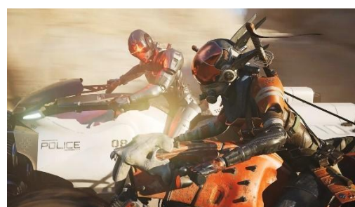
Digital frontier Grand Prix 2021 「Best CG Animation Award (Adarnia : A Sci-fi short film)