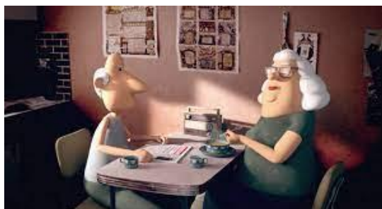
93rd (2021) Academy Award for Best Animated Short Film, "YES-PEOPLE"

In addition to the 28 nominated shorts, the CG Animation Program including the 93rd Academy Award for Best Animated Short Film winning "YES-PEOPLE," and the Digital Frontier Grand Prix 2021 Best CG Animation Award winning short film "Adarnia: A Sci-fi Short Film as a Special Invitation short," will start screening on Friday, June 11 at online and Tokyo Venue.