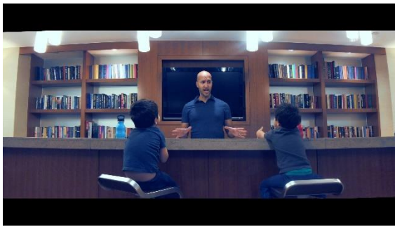
The Cookie Heist Kamran Khan / 0:08:57 /U.S.A./Comedy/ 2020

Two brothers must put aside their differences in order to avoid their father and steal cookies from the top of the fridge.