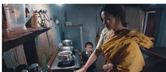
The Bird Song Lawrence Chandam / 0:03:00 /India /Drama / 2020

A middle-aged mother of two reflects on her emotional decision to immigrate to the United States some 30 years earlier, in this reflective documentary short that borrows its title from a uniquely powerful poem by the legendary exiled Cuban writer Lourdes Casal.