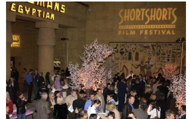
SSFF & ASIA in LA at Egyptian Theater