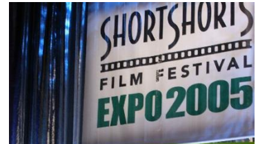
SSFF Expo was held at Nagoya, Aichi