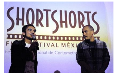
International Tour was held in Mexico