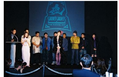
SSFF ASIA which focuses on short from Asia & Japan started