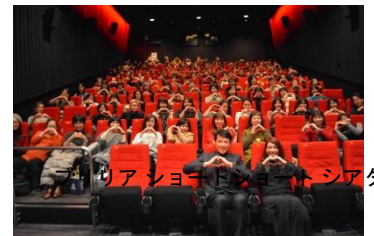
Brillia Short Shorts Theater was Open