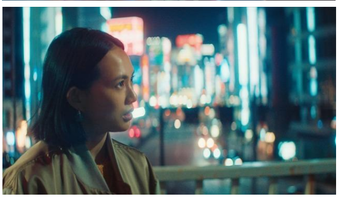
▼Stills are available at the link below <a href="https://drive.google.com/drive/folders/1lb50USp65bTmRln9YA_61RSPB8yRK6iv?usp=sharing">https://drive.google.com/drive/folders/1lb50USp65bTmRln9YA_61RSPB8yRK6iv?usp=sharing</a>