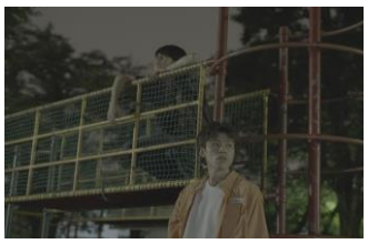
From left, “NEW GENERATION” “Scapegoat” “When She Dresses Up” “How Far”